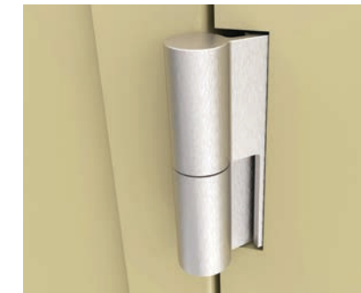
IAC's proprietary cam lift hinge