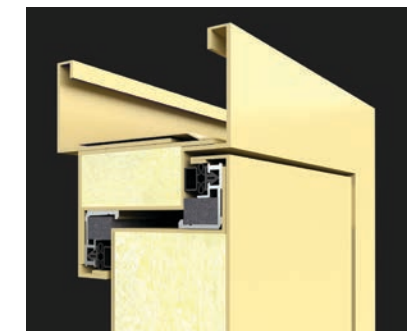
Split frame assembly